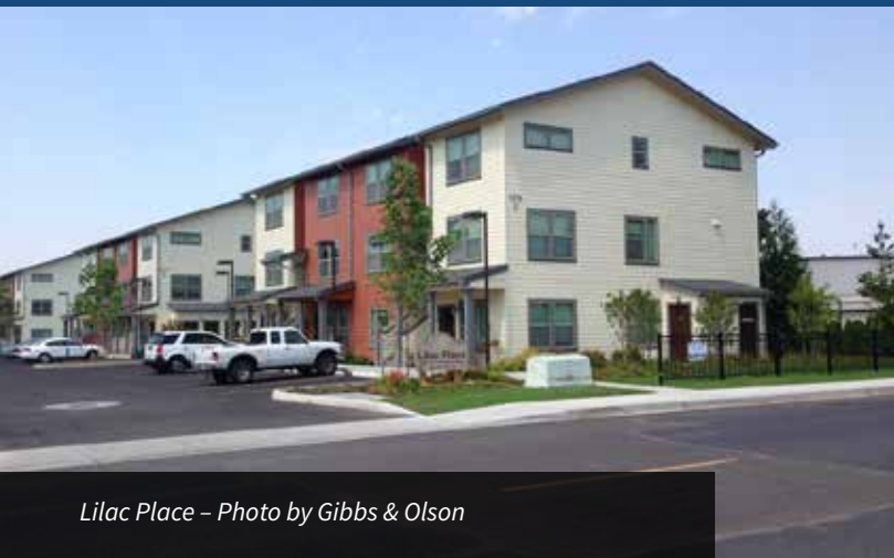
Lilac Place – Photo by Gibbs & Olson

ADAMS: 5 FRANKLIN: 4 LEWIS: 3 SNOHOMISH: 42 ASOTIN: 1 GRANT: 17 LINCOLN: 4 SPOKANE: 52 BENTON: 9 GRAYS HARBOR: 2 MASON: 2 STEVENS: 3 CHELAN: 14 ISLAND: 2 OKANOGAN: 14 THURSTON: 5 CLALLAM: 9 JEFFERSON: 3 PACIFIC: 5 WALLA WALLA: 6 CLARK: 21 KING: 326 PEND OREILLE: 1 WASHINGTON COUNTY, OR: 2 COWLITZ: 6 KITSAP: 7 PIERCE: 63 WHATCOM: 19 DOUGLAS: 4 KITTITAS: 3 SAN JUAN: 13 WHITMAN: 7 FERRY: 1 KLICKITAT: 2 SKAGIT: 14 YAKIMA: 28 SKAMANIA: 4