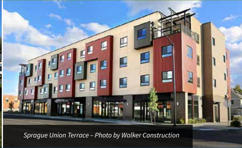
Sprague Union Terrace