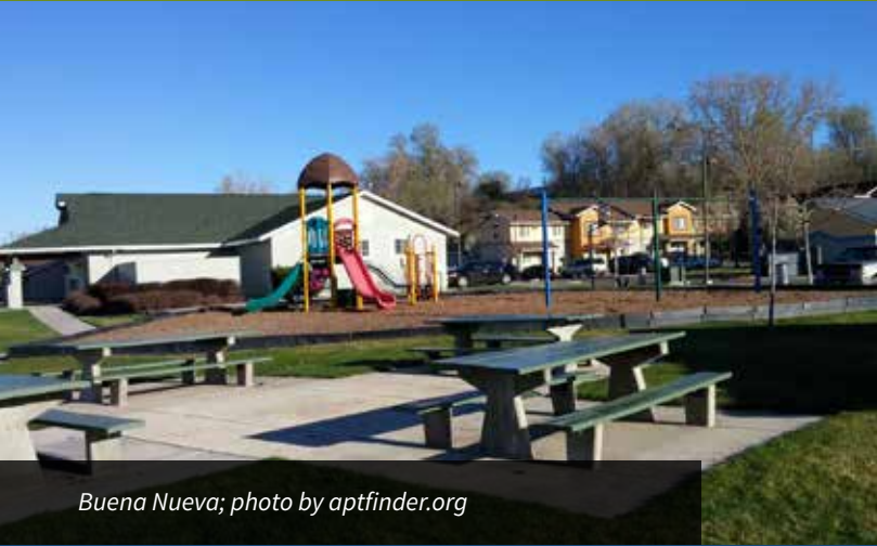
Buena Nueva